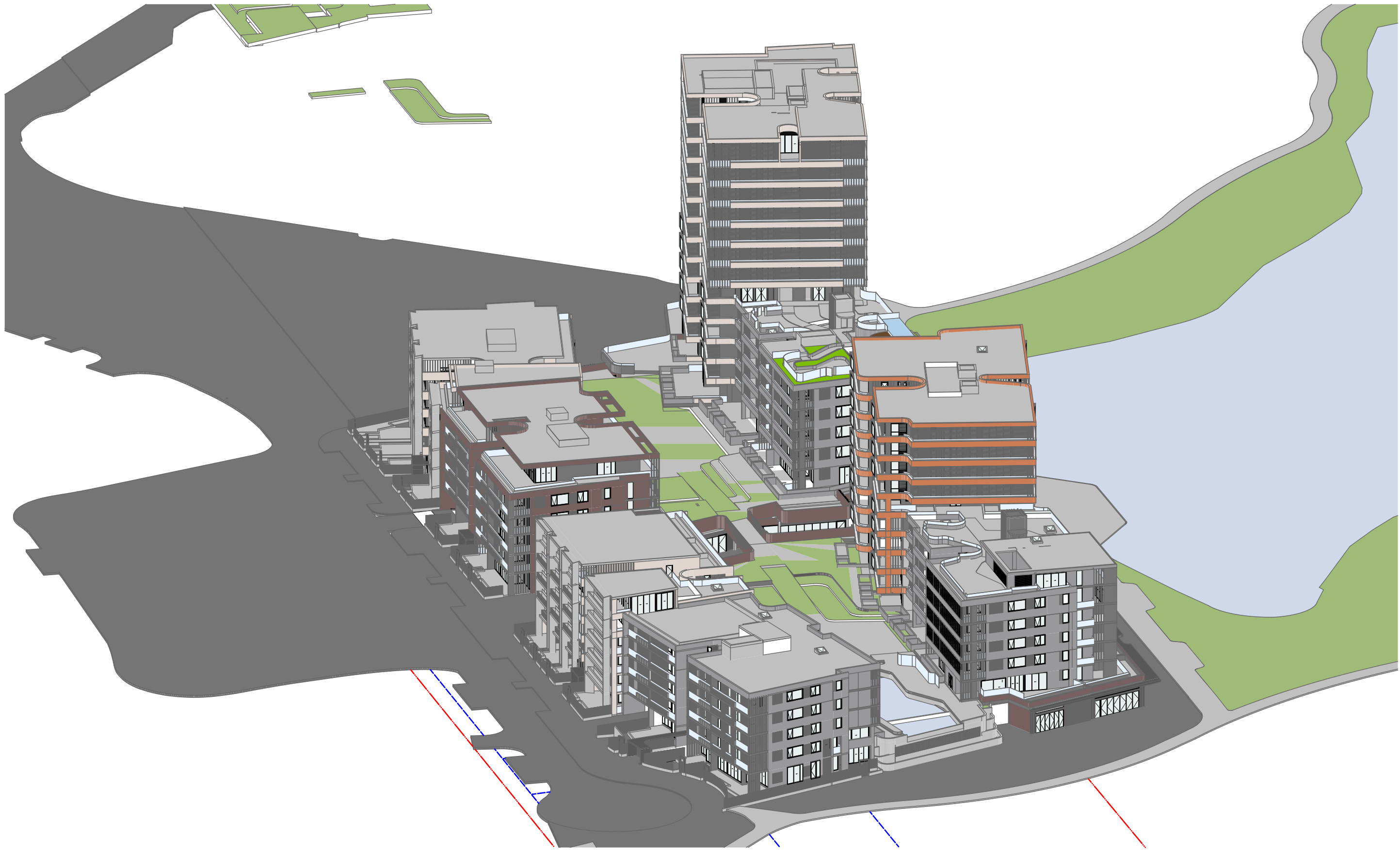
4 June 21st 12pm

NOTES THIS DRAWING IS COPYRIGHT © OF TURNER. NO REPRODUCTION WITHOUT PERMISSION. UNLESS NOTED OTHERWISE THIS DRAWING IS NOT FOR CONSTRUCTION. ALL DIMENSIONS AND LEVELS ARE TO BE CHECKED ON SITE PRIOR TO THE COMMENCEMENT OF WORK. INFORM TURNER OF ANY DISCREPANCIES FOR CLARIFICATION BEFORE PROCEEDING WITH WORK. DRAWINGS ARE NOT TO BE SCALED. USE ONLY FIGURED DIMENSIONS. REFER TO CONSULTANT DOCUMENTATION FOR FURTHER INFORMATION (DWG, PC AND BIM) FILES AND UNCONTROLLED DOCUMENTS AND ARE ISSUED FOR INFORMATION ONLY.